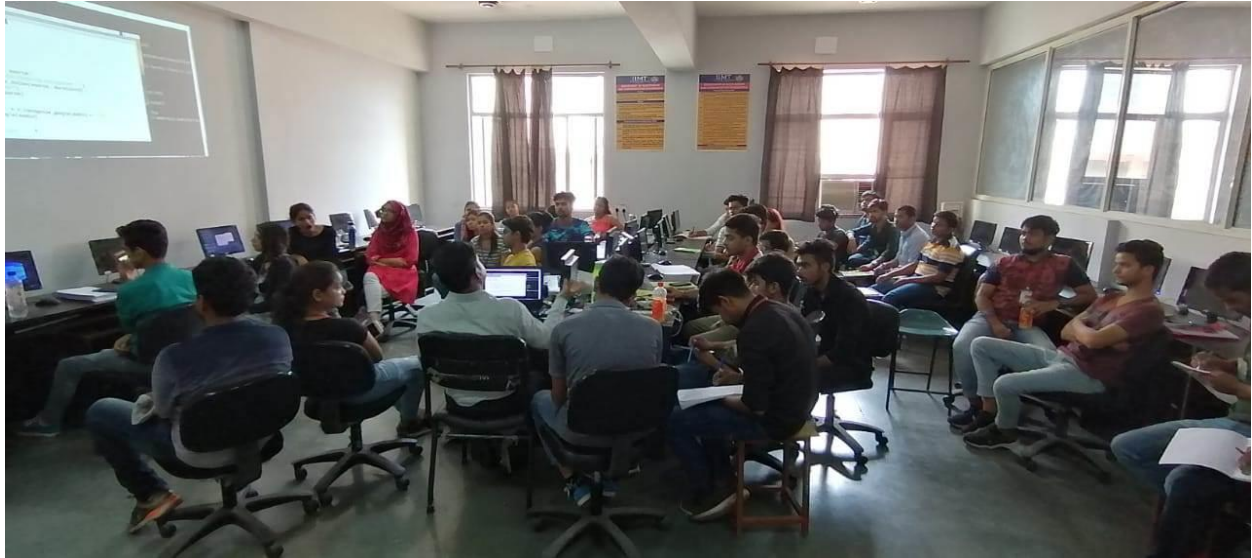
Workshop on IOT using MSP 430 Tool and Raspberry Pie with Artificial Intelligence