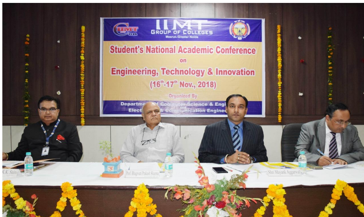
Conference on “Engineering, Technology & Innovation”