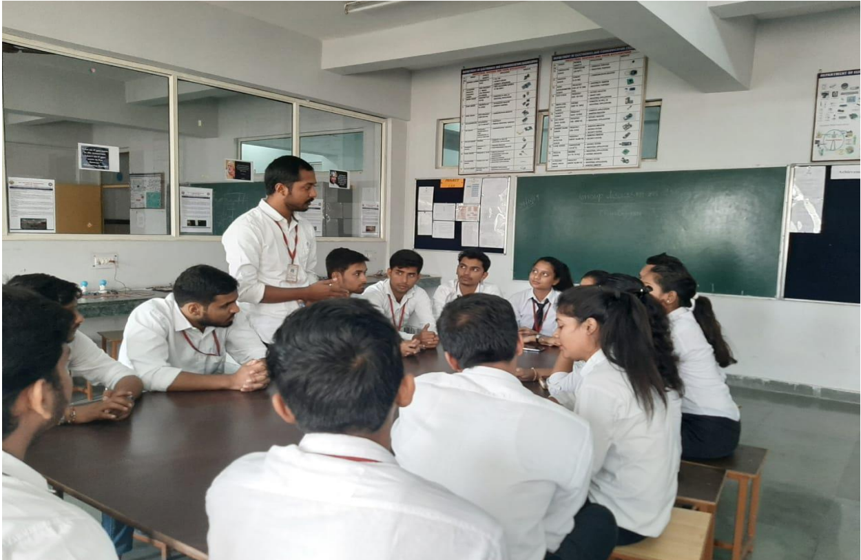
Group Discussion on Success of Chandrayan II Mission