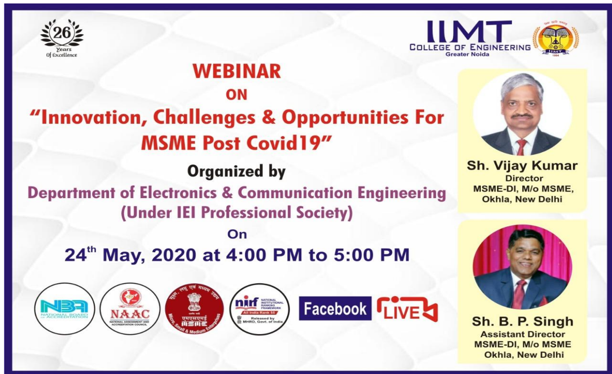
Webinar on “Innovation, Challenges & Opportunities for MSME post Covid-19