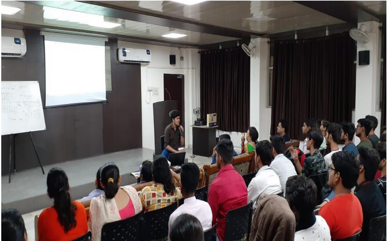
Guest Lecture on Artificial Intelligence and Machine Learning