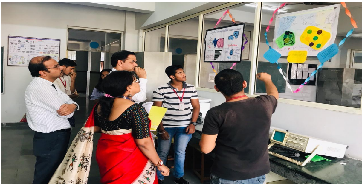
Poster Presentation Competition