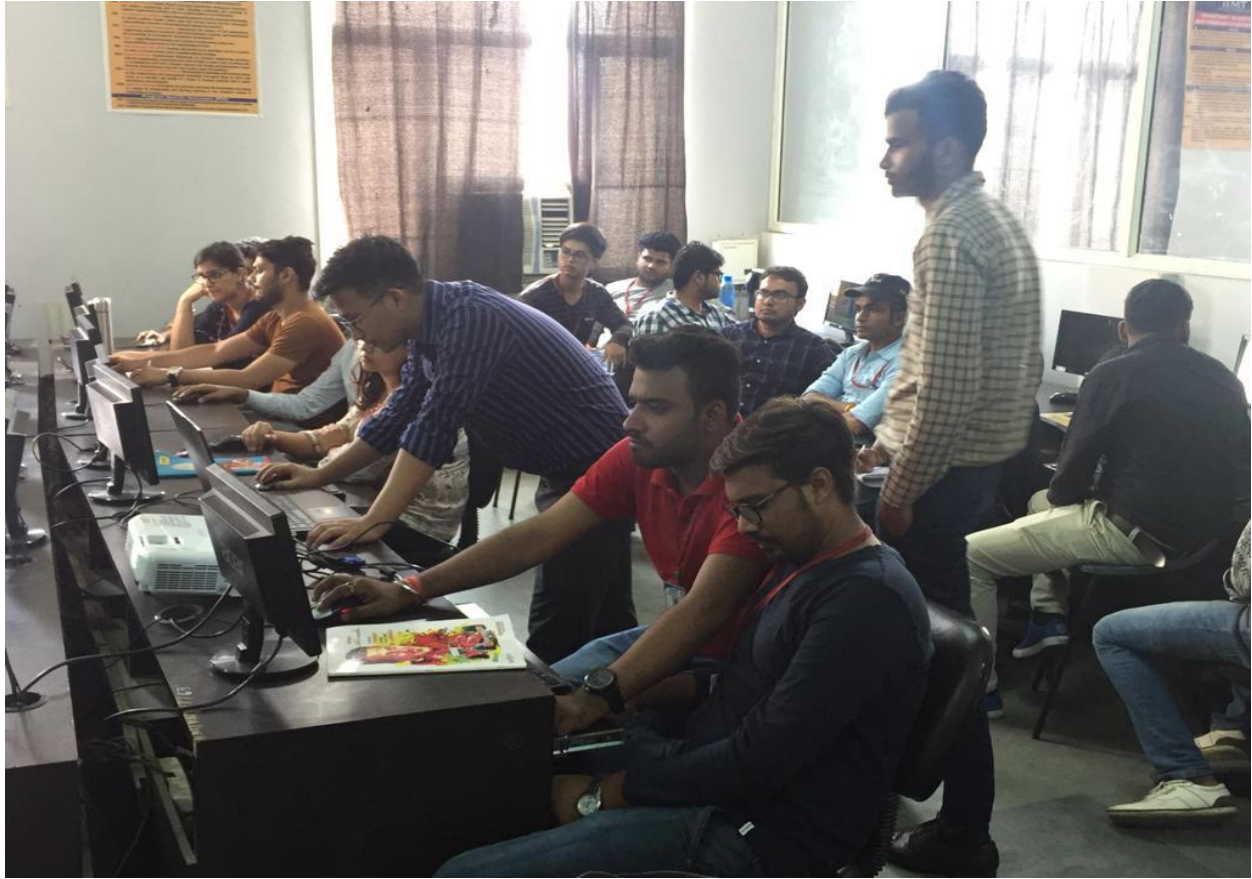
Workshop on Implementation in Verilog HDL for digital circuits